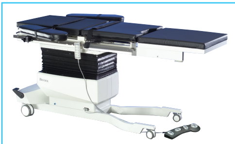
Radiolucent extension converts the Urology Table into a general purpose Surgical Table.