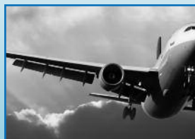
TRAVEL FEES COVERED