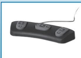
GENUINE BIODEX PARTS