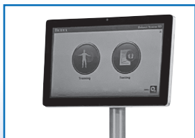
GENUINE BIODEX PARTS