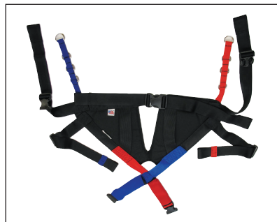
Closed-seat harness supports patients securely and comfortably