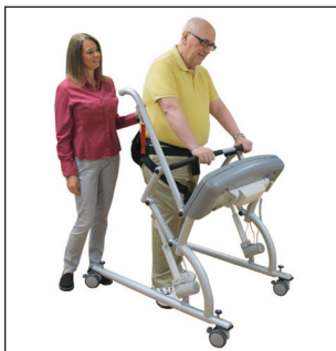
Motorized stand assist and walker – in one device