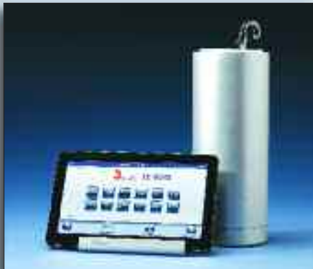
Atomlab™ 500 Dose Calibrator

Bring science, technology and applications together...with Biodex