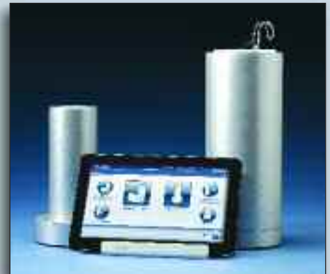
Atomlab™ 500Plus Dose Calibrator