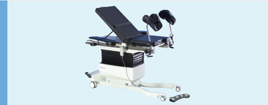
Brachytherapy C-Arm Table 810