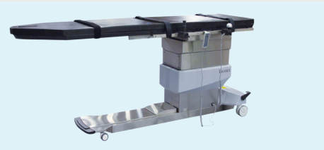
Surgical C-Arm Table 846