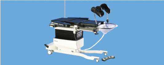
Urology C-Arm Table 800