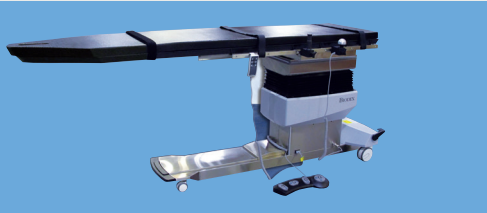
Surgical C-Arm Table 840