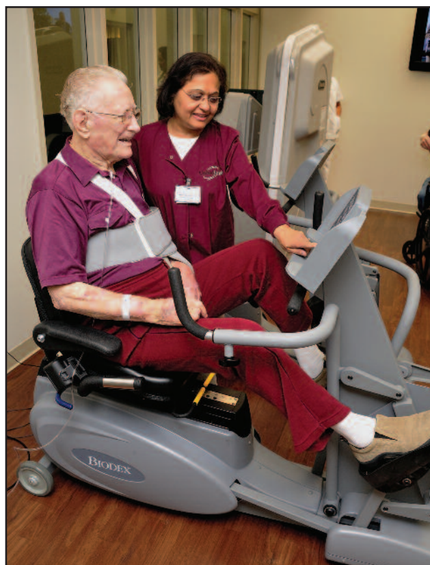
The Biodex BioStep is good for both endurance and lower extremity strengthening.

After hip or knee surgery, most surgeons want their patients to put as much weight on the operated limb as the patient can tolerate. The right kind of stress actually enhances bone healing. Without guided rehabilitation, many patients – perhaps, most – favor their un-operated leg. If they would walk like that for perhaps six to eight weeks until the pain subsided, they would develop bad gait patterns. Months later, such people are still displaying a short step length, which can increase their risk of a fall. And when they have to walk long distances, they're limping.