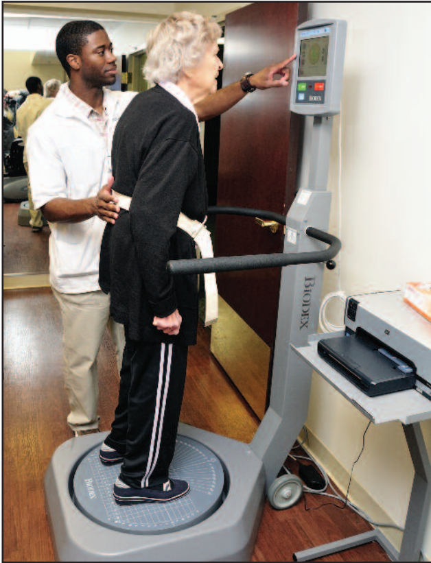
The Biodex Balance System SD improves weight-shifting capabilities in all axes.