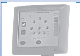
GENUINE BIODEX PARTS