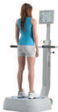
Play It S.A.F.E. ® PRO Includes Balance System SD TM