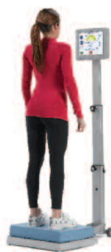
Play It S.A.F.E. ® VARSITY Includes Portable BioSway