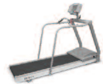
Shown with Extended Handrails