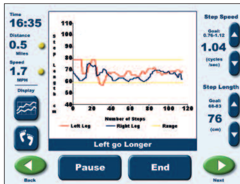
Histogram Screen - plots right and left step lengths / symmetry