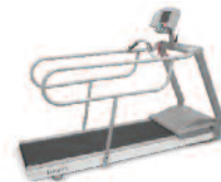
Shown with Geriatric/Pediatric Handrails